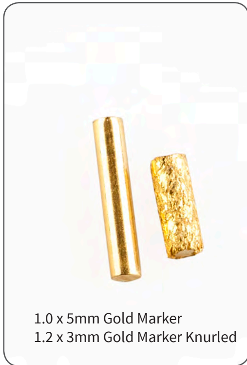
1.0 x 5mm Gold Marker 1.2 x 3mm Gold Marker Knurled